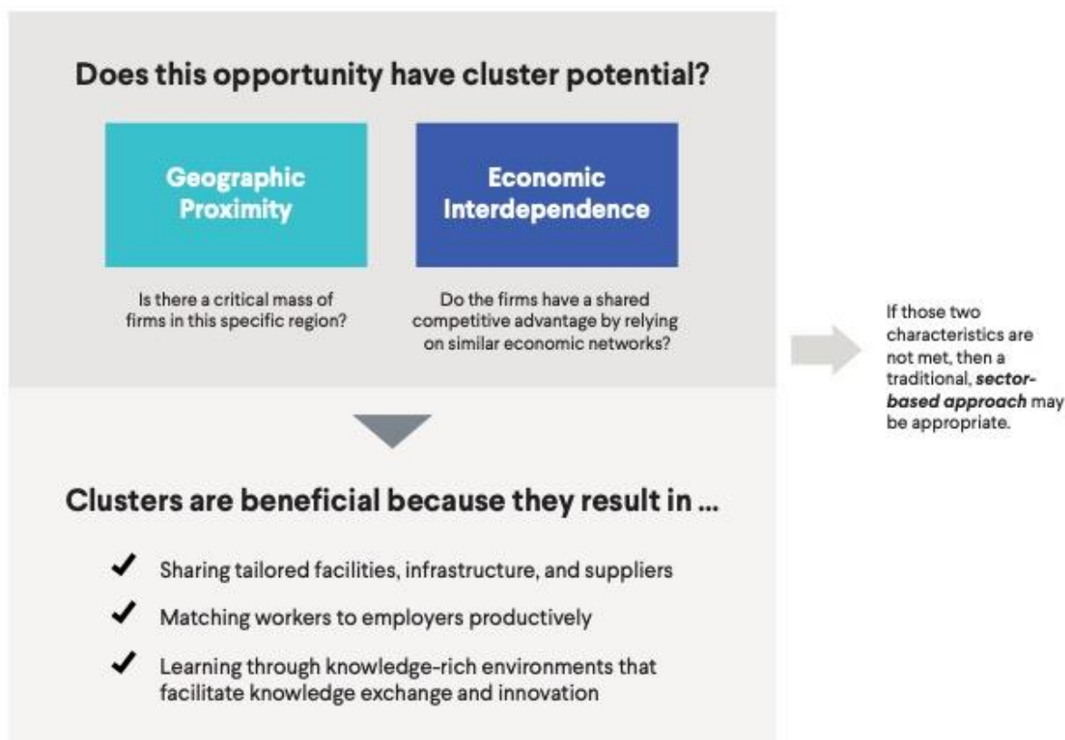
Figure 2: Cluster versus sector development. 7

The following outlines how to determine whether a region could benefit from a cluster-based economic development approach, what those strategies could look like, and the potential impact of those initiatives compared with a sector-based model.