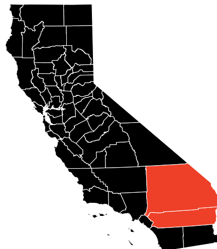
Figure 1: Map of the Inland Empire.

We will use an emerging model in the Inland Empire region of Southern California called Inland Economic Growth & Opportunity, or IEGO, to explore how a region can develop a cluster-based economic development strategy that prioritizes the triple bottom line of quality jobs, environmental sustainability, and inclusive growth. Located just east of Los Angeles, the Inland Empire represents the combined metropolitan area of Riverside County and San Bernardino County in Southern California, comprising approximately 4.6 million residents across 27,000 square miles. It is one of the fastest-growing population centers in the United States and is expected to grow to approximately 7 million residents in the next 30 years. 5